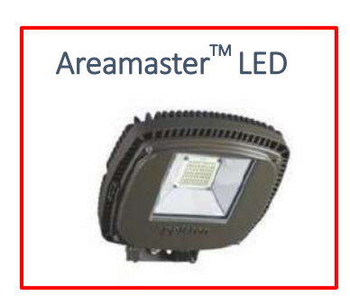
Flood and high bay lighting for harsh industrial and hazardous locations

Hazardous industrial locations have always demanded lighting fixtures that deliver utmost safety and dependable illumination for critical tasks. But some things are changing right before your eyes. Lighting designs in hazardous locations are increasingly responsible for energy efficiency and "green" operations to save money and precious resources. LED lighting has come to hazardous locations, and the FE / Mercmaster LED luminaire is setting the industry standard