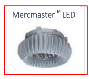
Task and general purpose lighting for harsh, rugged and hazardous locations